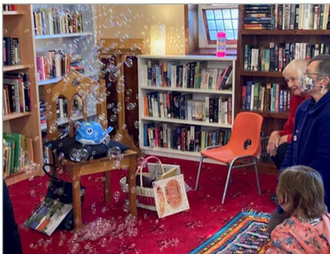
Left: Storytelling at the White Goose in Riddells Creek

As I write this, our Presbytery is preparing to have difficult conversations about our future. By the time you read this, we will have met with others from around our proposed region of the Presbytery. We have tough questions to consider, and a proposed solution to some of the issues that we are facing as a denomination now and into the near future. I hope you have had members of your congregation contributing to this conversation, as I believe that the Macedon Ranges Partnership has some unique experience to share. We came together, recognising there would be difficulties, but with a deep hope in God’s ability to bring new life, and a deep commitment to following the call of the Spirit wherever we might be led. (continued on page 3)