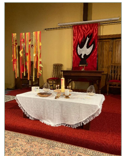
Right: Worship space on a Monday at the Faith Community (Prayers for Peace) in Woodend