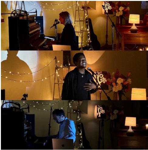
Some photographic highlights from The Simba Sessions in November