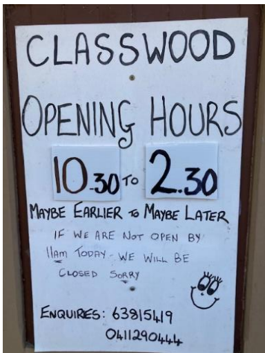
Some signs found on Meg's travels in Tasmania recently