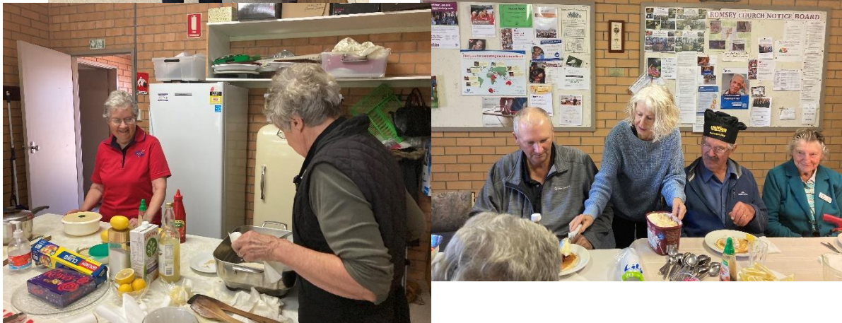
PIP #88 JUNE 2023