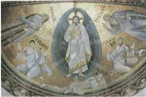
St Catherine's Monastery, Sinai (c. 565 A.D)

The earliest surviving image of the Transfiguration is from St Catherine's monastery in Sinai, a place which, because of its seclusion, is home to many early icons. In the apse of the catholicon there is a mosaic of the Transfiguration, dating from the middle of the sixth century.