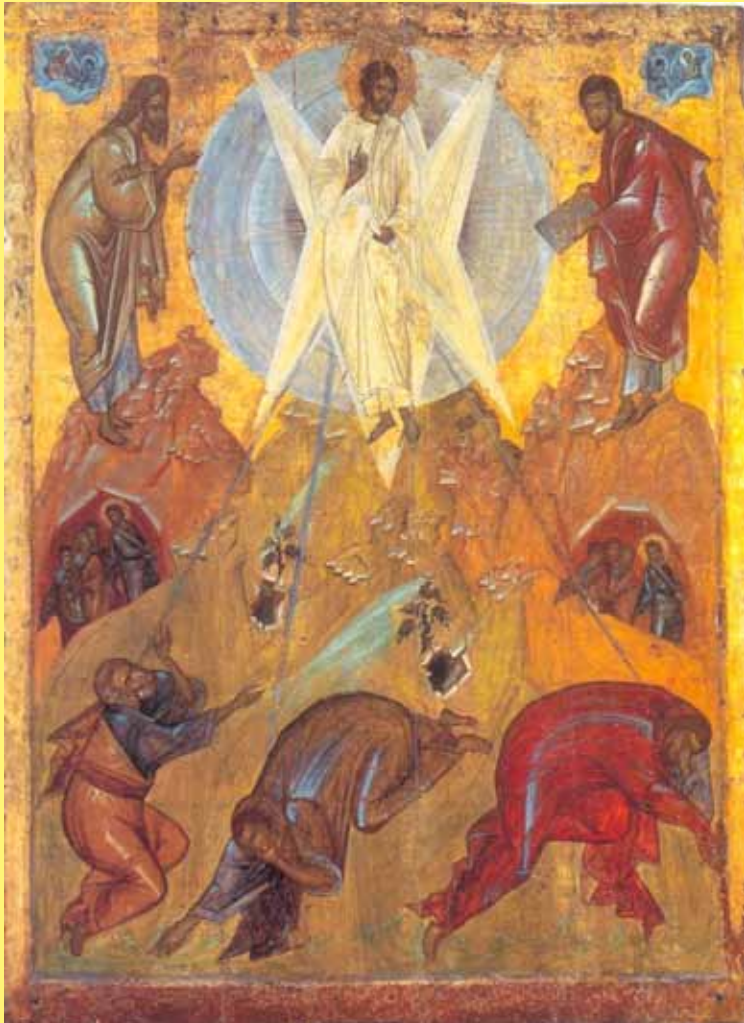
Transfiguration - The Icon of Theophanes the Greek (late 14th Century)

Seasons - Transfiguration, Ash Wednesday & Lent 1-3