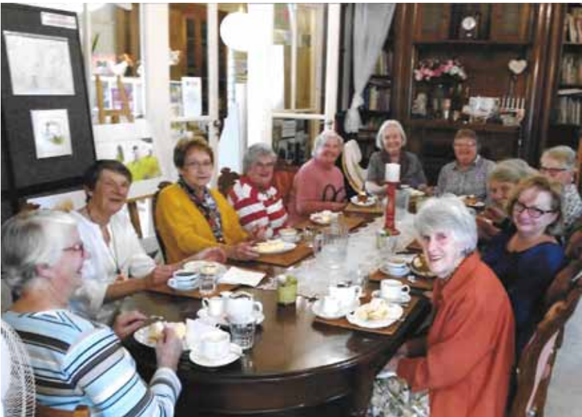
We enjoyed a delicious afternoon tea in the Dromkeen Dining Room after the tour of the sand sculptures. The Vanilla Slices were amazing!!