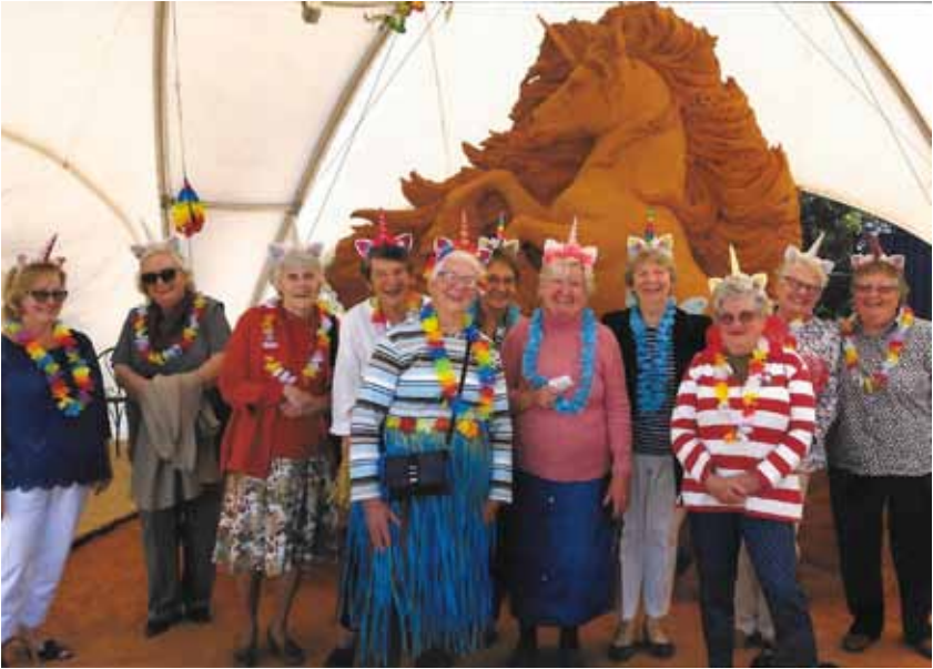
Mt.Macedon Thistle Club members spent a lovely afternoon at the 'Enchanted Forest' sand sculptures at Dromkeen in Riddells Creek. (We even dressed as unicorns at one stage).