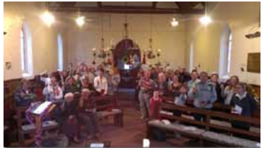
Congregation at Tylden Christmas Eve 2014