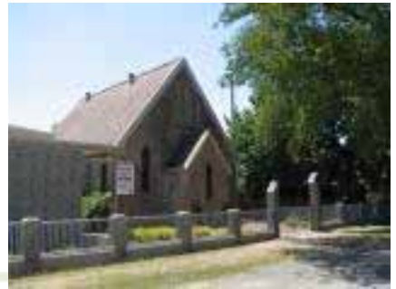
St Andrew's Woodend