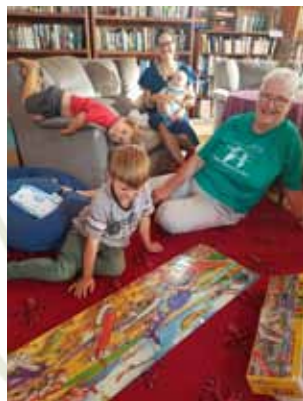
Some of the action and worshippers at the Inter-generational Service at Riddells Creek in March.