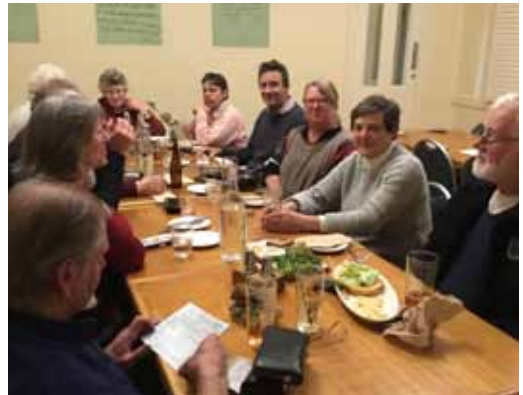
OpShop Dinner, Thursday 16th August

The Op shop also welcomes our new sorting team who are working at the Woodend Hall Mondays from 1pm till 3pm . Anyone who would like to come is welcome. The volunteers are also invited to lunch in the hall at 12 noon.