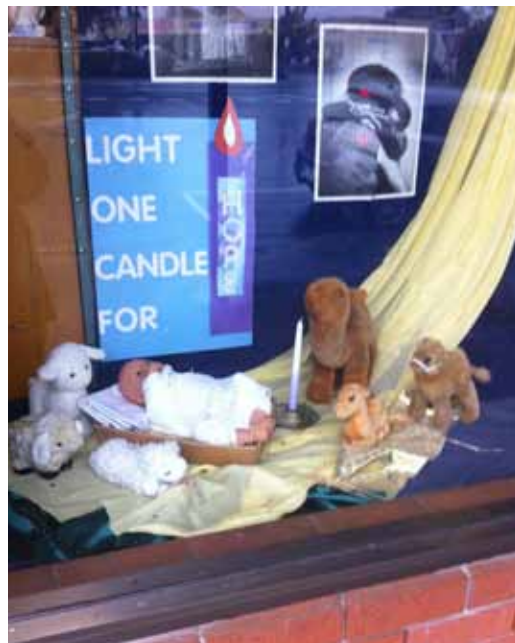
Woodend Op Shop window during Advent last year

We have been watching the back-to-school sales this past month and been scooping up bargains for this year's collection. One of the best deals has been 48 page exercise books at Officeworks. The catch being that you were only allowed to purchase 30 books per customer. Jay visited 3 different stores on her way home from visiting her parents adding less than 1 kilometre to her normal journey.