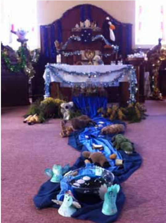
Left: Tylden's wreath, below: Romsey's wreath

Congregations used the water image in different ways. Mt Macedon and Romsey used water from different sources ie tap water, dam water, creek water etc. The wreaths were laid out in imaginative ways. Some neat and orderly, others used natural props. Tylden's was extensive and extended the water theme creating a river which was updated each week with Australian animals and native wildflowers.