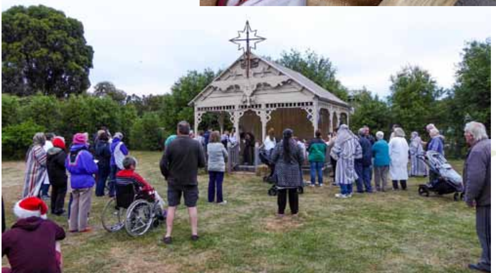
Adults gathered around the 'stable'. The children were closer and in the 'stable'.