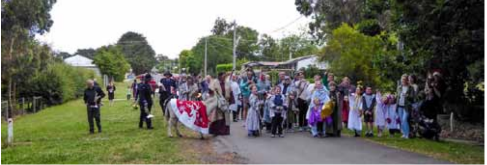
Above: the walk approaching the church grounds. Below: hearing about the angels and shepherds