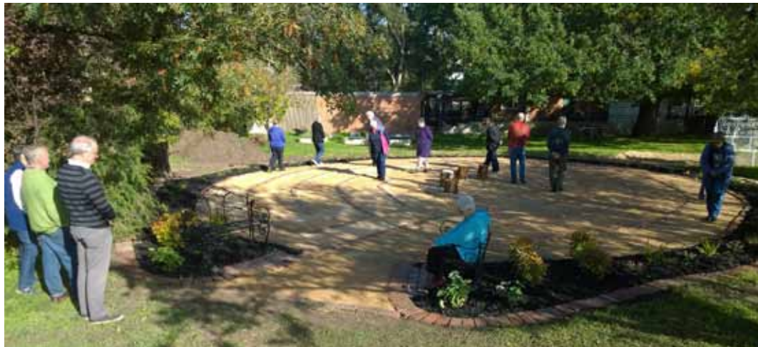
Members of Coco Walking the Labyrinth on Saturday 6th May