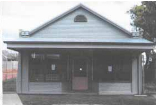
Present location - 22 Market St