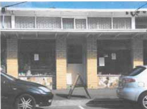
2nd location - 6 Market St

The shop began in High St with 10-12 volunteers. It operated there for 13 years until it moved to 6 Market St. After 28 years there the Op Shop moved, in 2008, to the present location at 22 Market St. They now have 88 volunteers.