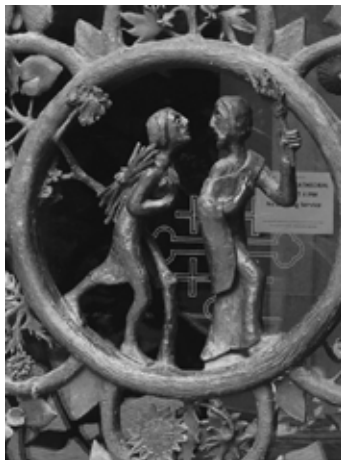
Detail from the gate on the front door of the National Cathedral in Washington DC, an image of Abraham and Isaac from Genesis 22

the Smithsonian, which, I discovered, is not a single museum but a whole series of enormous museums, each of which could take a day to