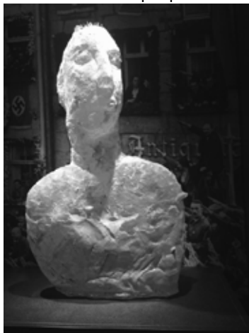
A glass sculpture from an exhibit about Dietrich Bonhoeffer at the National Liberty Museum in Philadelphia

the steps that Rocky ran up in his first movie) I discovered the quaint Chemical Heritage Foundation museum and the inspiring National Liberty Museum. Despite its grand title, it's only a small museum, housing displays about inspiring people who "Live like a Hero" alongside beautiful glass sculptures. I loved this place, mainly because it didn't just honour the obvious heroes, but people like good teachers, conductors who seek to bring music to as many people as possible, and everyday people who have done extraordinary things in sometimes difficult circumstances. A truly inspiring place.