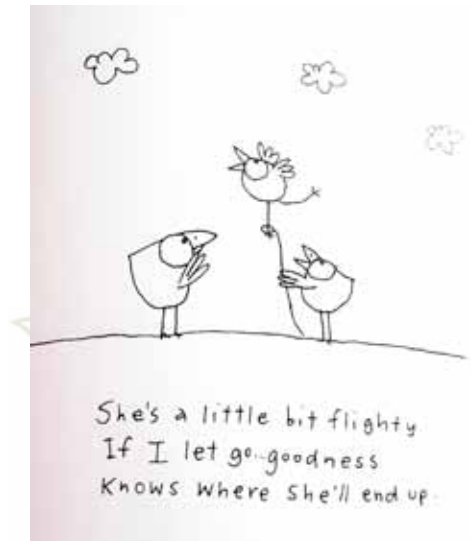
From "It's not always black and white; a colorful take on life's grey areas" Kylie Knapp